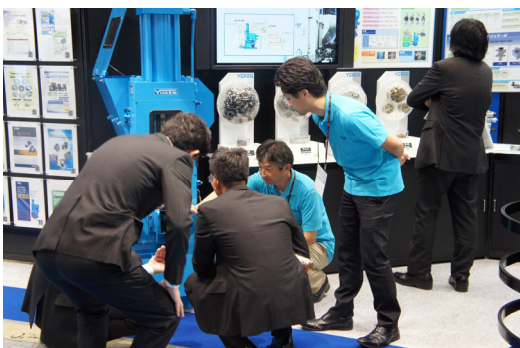
Automatic Shaving Compactor