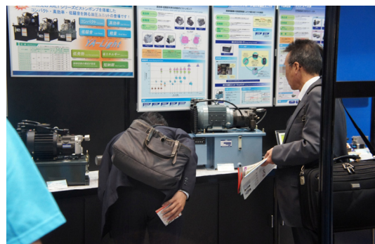
Energy-Saving Hydraulic Units