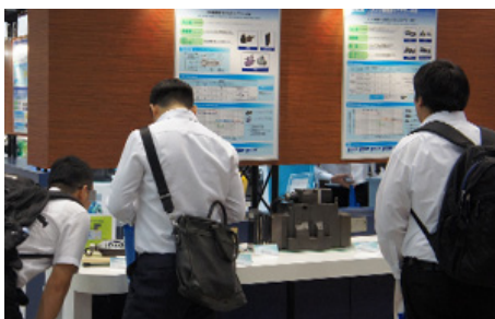
Linear Servo Valves