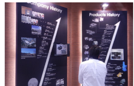
History of Yuken