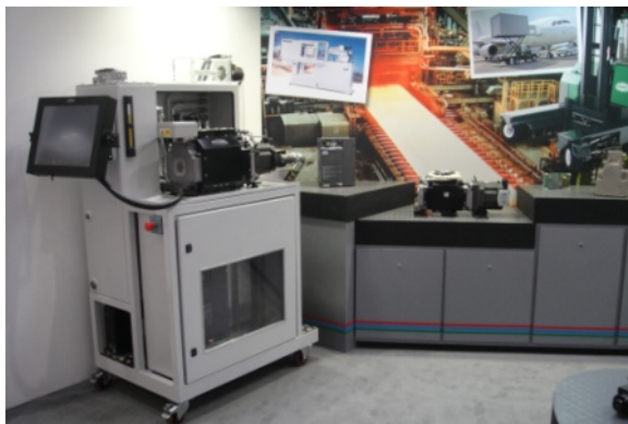
ASE Series Demonstration