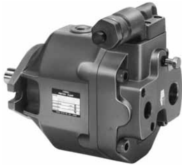
"AR" Series Variable Displacement Piston Pumps