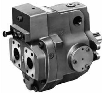
"A" Series Variable Displacement Piston Pumps