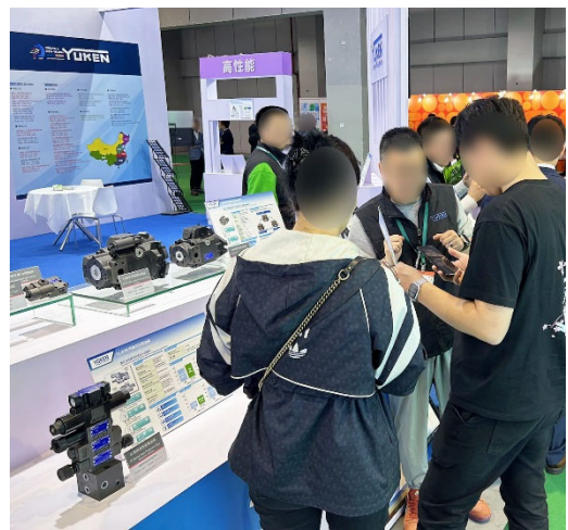
Yuken Booth Visitors