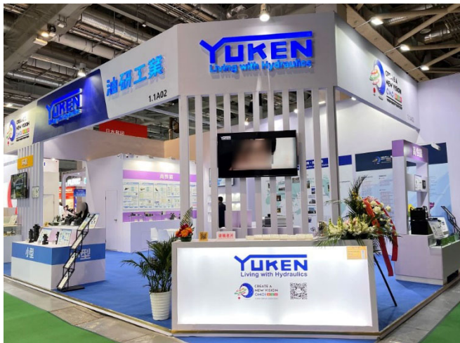
YUKEN Booth Outline

https://www.chinaplasonline.com/CPS24/idx/eng